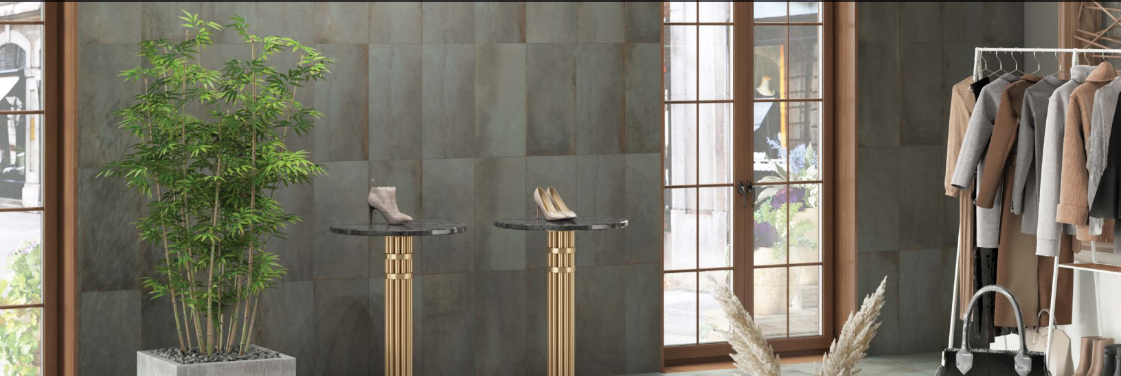
above: FDY30 12x24 Graphite