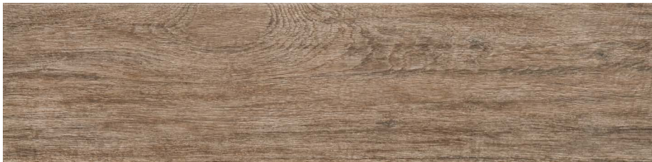
28092 6x24 Charleston Brown