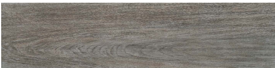
28060 6x24 Newport Blue