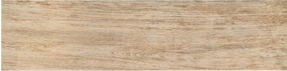
28034 6x24 Hampton Blonde