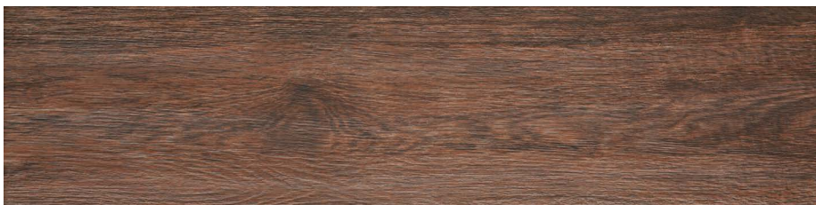
28088 6x24 Cayman Red