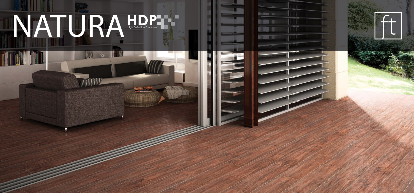
above: 28088 6x24 Cayman Red