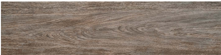
28013 6x24 Nantucket Gray