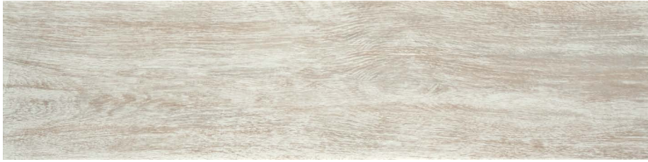
28004 6x24 Wilmington White