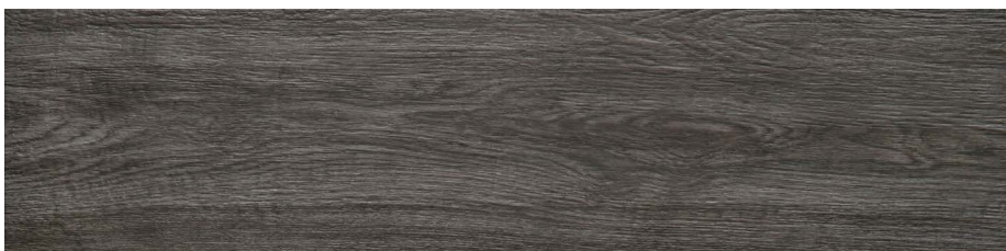
28017 6x24 Cape Cod Charcoal