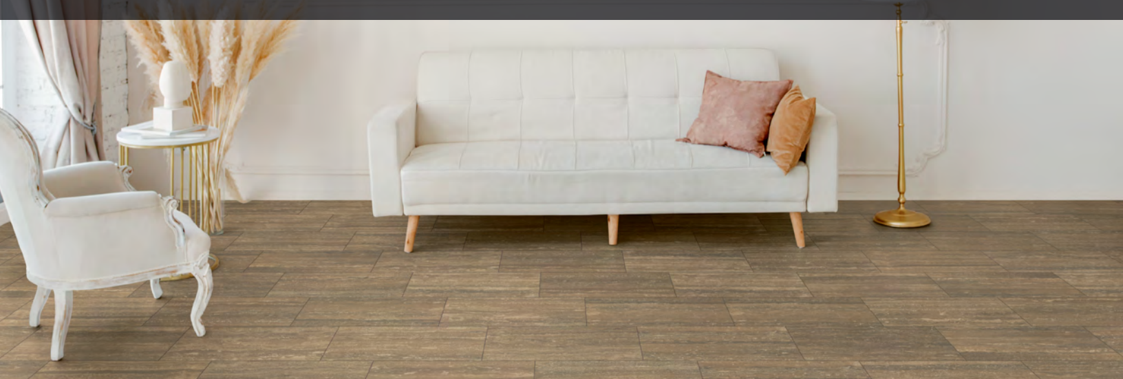
above: GVT40 12X24 Natural